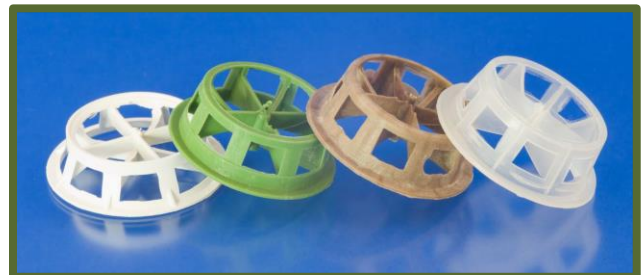
Low Profile Rings® Wet Scrubber and Air Stripper Tower Packing – in Various Plastic Resins Low Profile Rings® is a trademark of Raschig-USA, Inc.