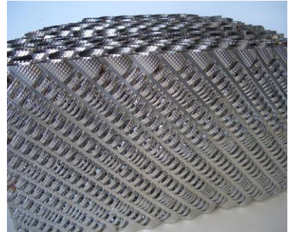
Raschig Super-Pak ® , Metal