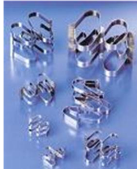
#2 Raschig Super Ring ® , Metal

Tower Internals: Raschig USA also carries a full line of liquid distributors, packing supports, hold down grids, mist eliminators and other towers internals. All of these items will be sized, if needed, based upon the specific needs of the project. If required in the project we will be pleased to quote these items.